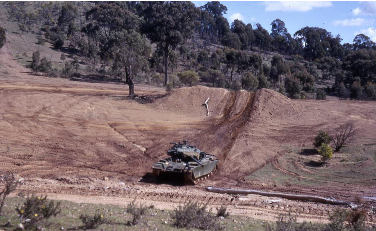
Centurions at the knife edges, at the back of Scrub Hill, Bronze Green & Black Tanksuits