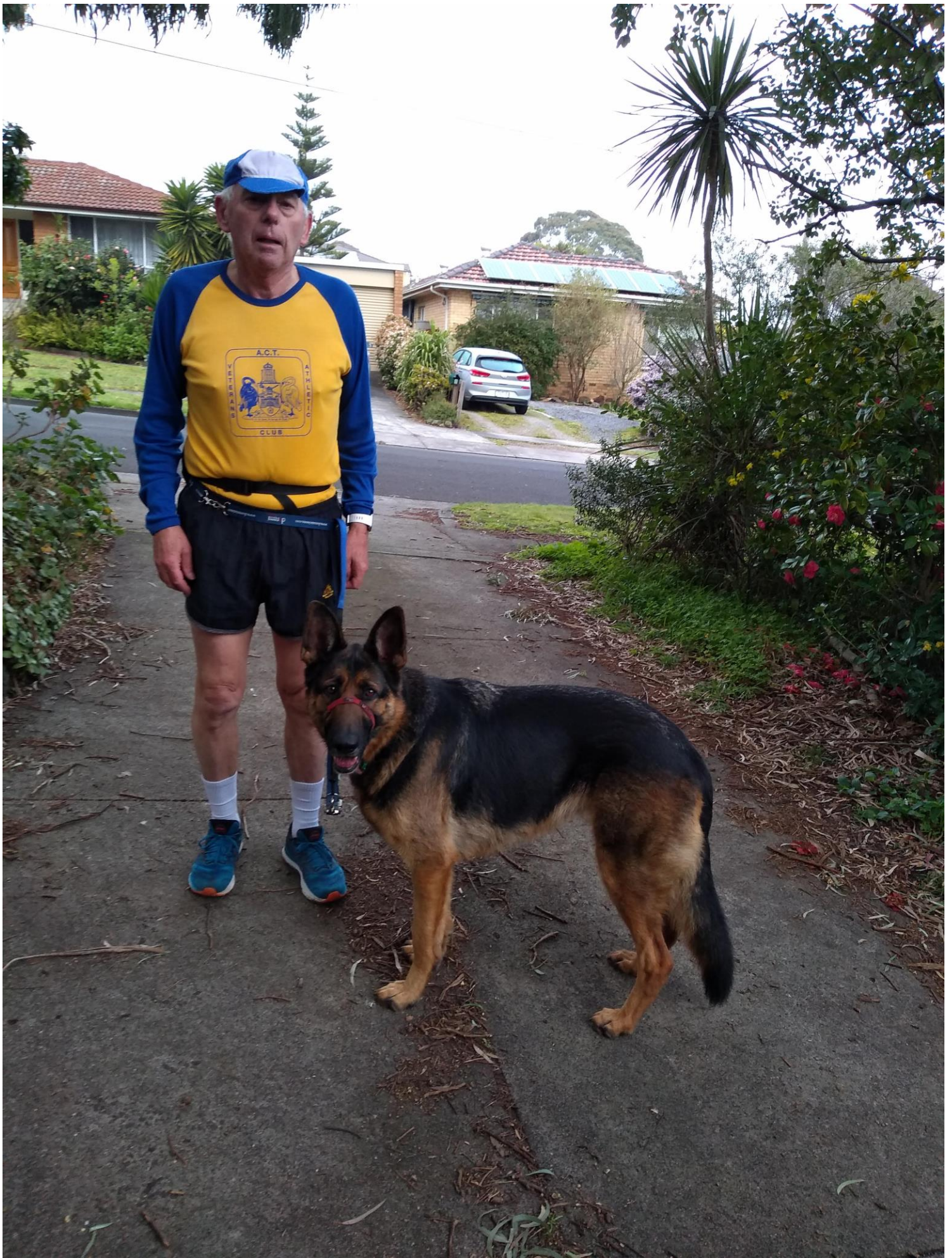
Treasurer in lockdown – stress relief 5 km limit!