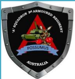
Item 2l A SQN