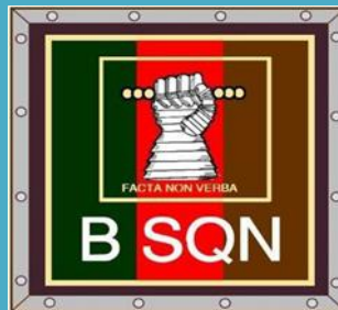
Item 2m B SQN