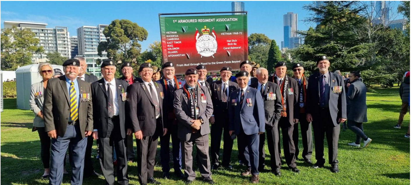
Association members at the conclusion of the march in the grounds of the Shrine of Remembrance