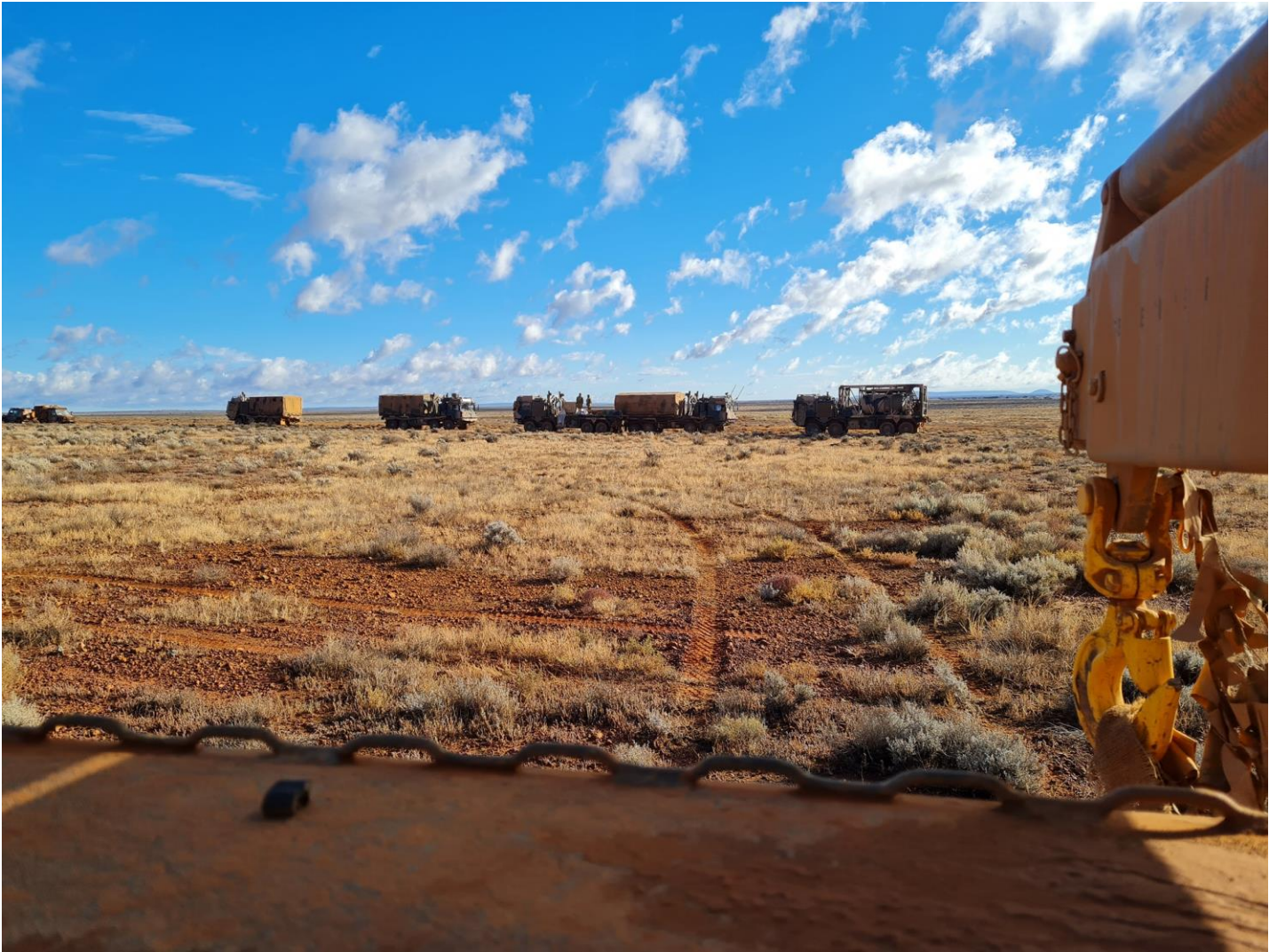
Spt Sqn hard at it – Linear Replen