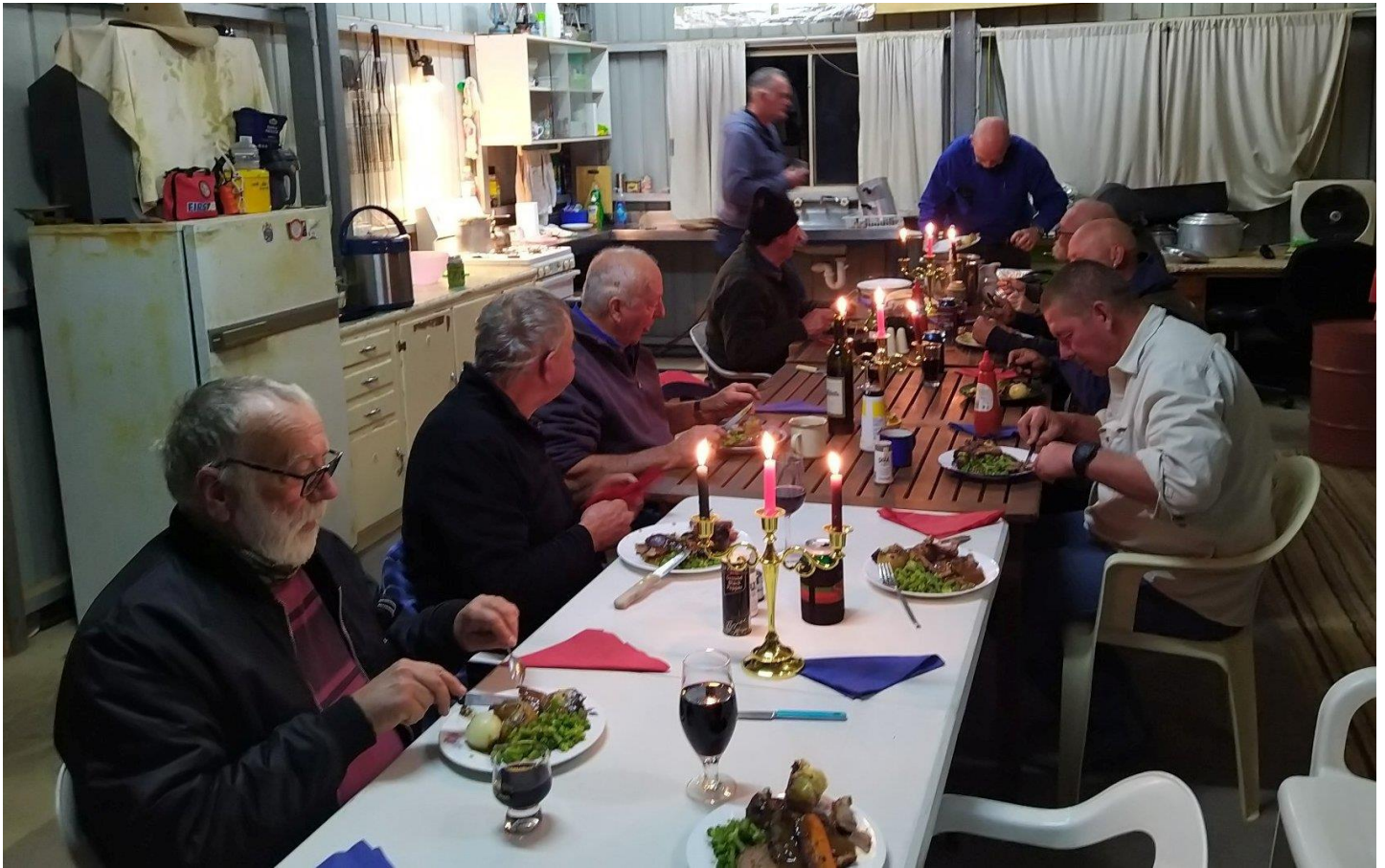
Veteran Retreat 2022 Crew 'Dining In Night'