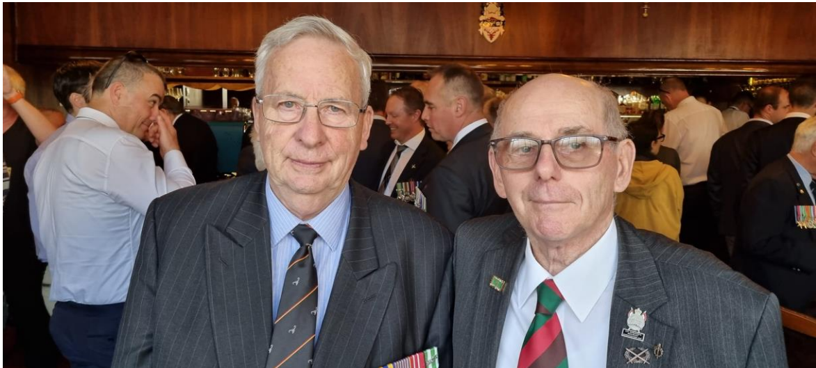
Association Secretary and Treasurer make an appearance at the Kelvin Club, Melbourne