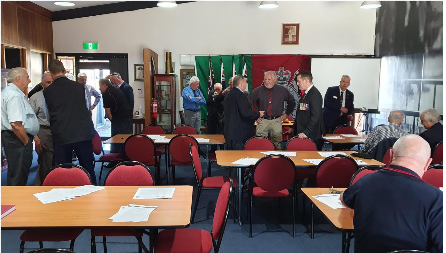
General discussions prior to the start of proceedings