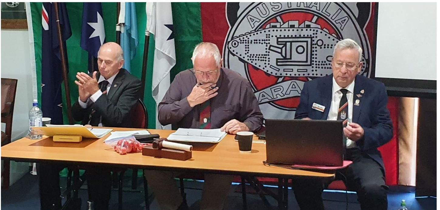
The 'Big Three' hard at work