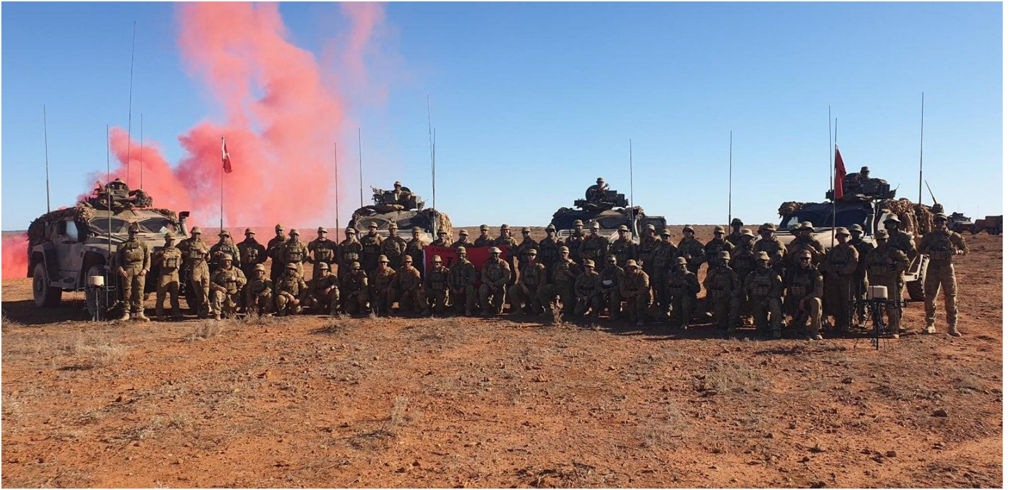
A Sqn mounted in Hawkei PMV-L – Cultana Nov 21