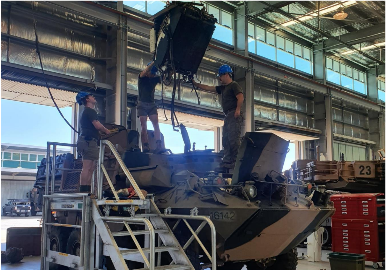
Spt Sqn – Barracks Pack Change

‘There are known knowns. These are things we know that we know. There are known unknowns. That is to say, there are things that we know we don't know. But there are also unknown unknowns. There are things we don't know we don't know.’