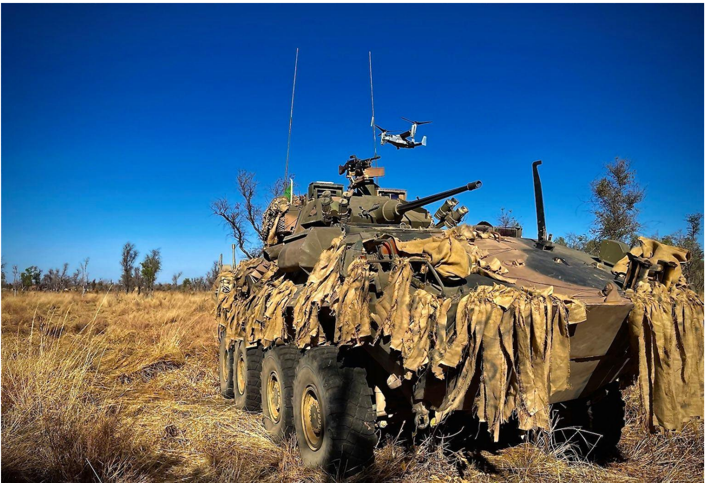
C Sqn ASLAV with Marine Corps Osprey VTOL aircraft overhead