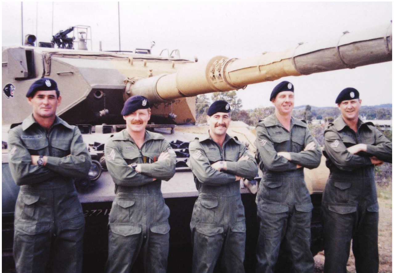
Cambrai Day 1994 – A Sqn 'Alphas'