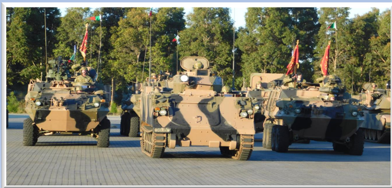
Cambrai Day Parade – November 2023

The Sub-Committee must start detailed planning!