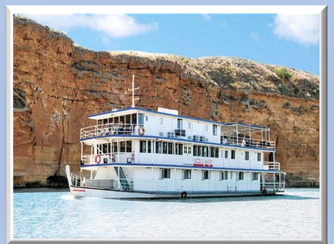
Murray River Day Cruise

Plus many other attractions including churches, the Casino, the Zoo, Parks and Gardens, Golf, Fishing, etc – come for three days or stay a week!