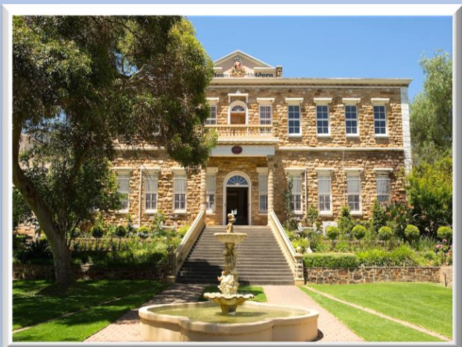
Chateau Yaldara Winery