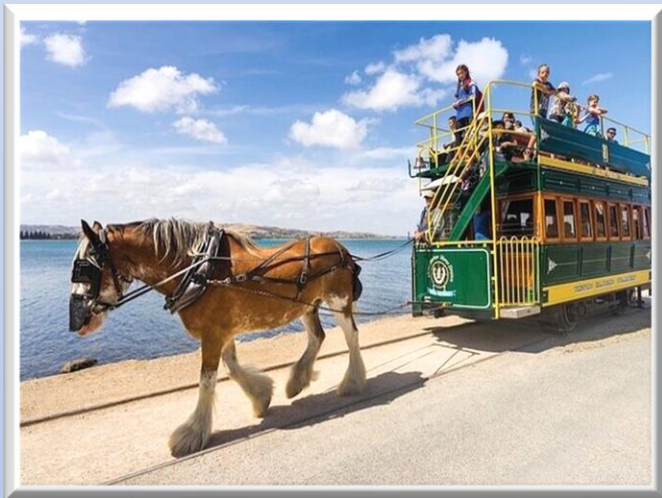
Victor Harbour – 7 days a week