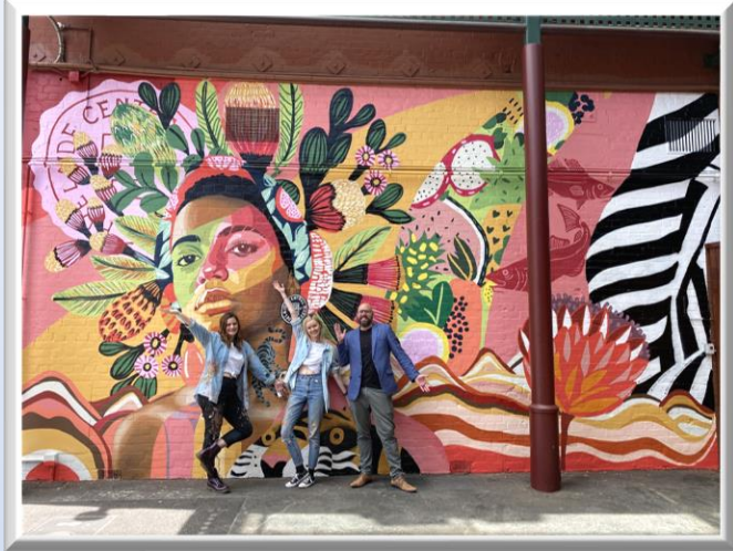
Adelaide Market – Free Entry