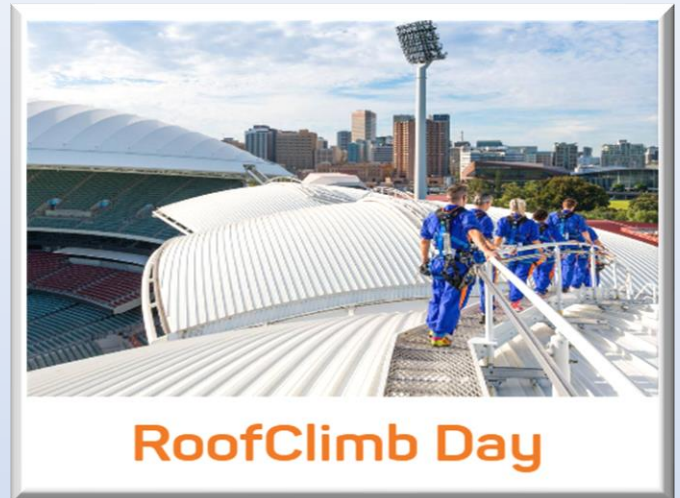
Adelaide Oval - $109 (adult)