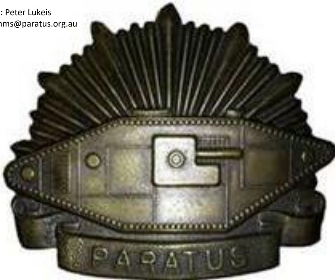
Australian Tank Corps – Brass Hat Badge – 1930 to 1942