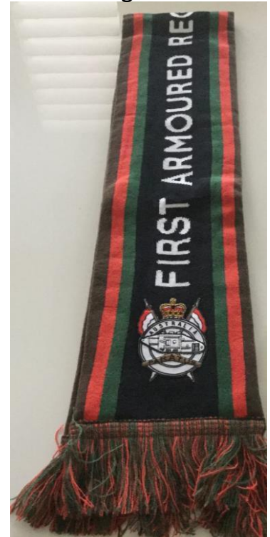
Item 8. Regt. Scarf

$25.00 plus postage Nil Stock – on order