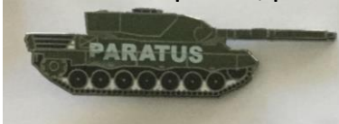
Item 1b. Leopard L/pin

$6.00 Plus Postage ** VERY LIMITED STOCK