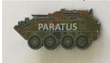
Item 1d. ASLAV L/pin

$6.00 Plus Postage ** VERY LIMITED STOCK