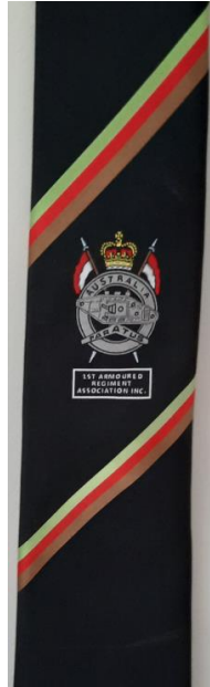
Item 7d. Tie

$25.00 plus postage Nil Stock – on order