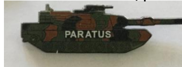
Item 1f. Abrams L/pin