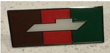
Item 1c. Badge, Lapel Colour Patch