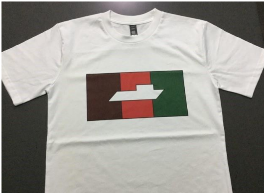
Item 9. Colour Patch 'T' Shirt