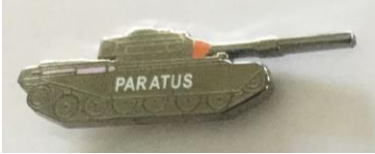
Item 1a. Centurion L/pin

$6.00 Plus Postage ** VERY LIMITED STOCK