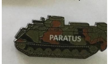
Item 1e. M113 L/pin

$6.00 Plus Postage ** VERY LIMITED STOCK