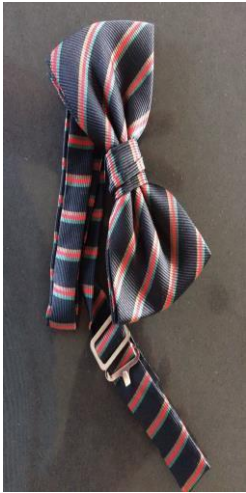
Item 7c. Bow Tie