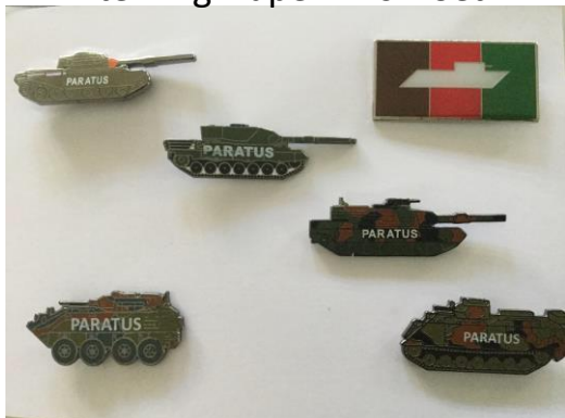
Item 1g. Lapel Pins – Set