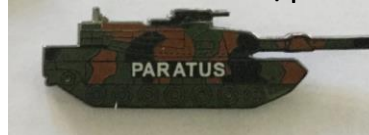
Item 1f. Abrams L/pin