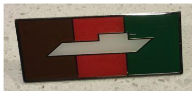
Item 1c. Badge, Lapel Colour Patch