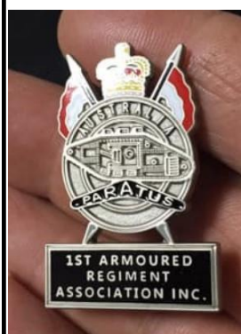
Item 1k – New Membership Badge issued upon joining the Association. Additional badges may be purchased by Members at only $5.00 each plus postage.

NOTE: Items that include the word 'Association' are only available to Association Members!