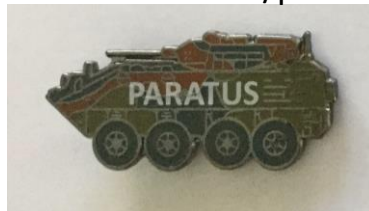
Item 1d. ASLAV L/pin