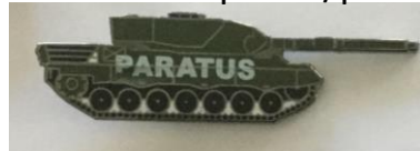
Item 1b. Leopard L/pin