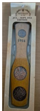
Two-up Set - Great War Declared – New Item