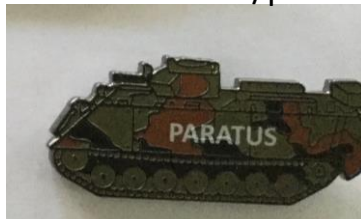
Item 1e. M113 L/pin