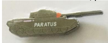
Item 1a. Centurion L/pin