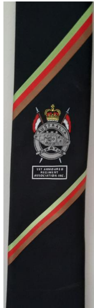
Item 7d. Tie

$12.50 Very Limited Stock – unlikely to be re-ordered