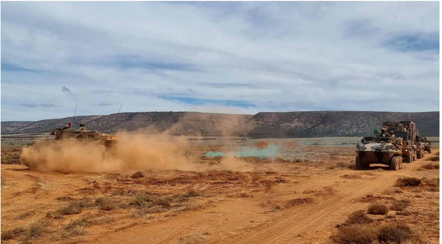
Non RAAC 'Replen' crews conduct live fire