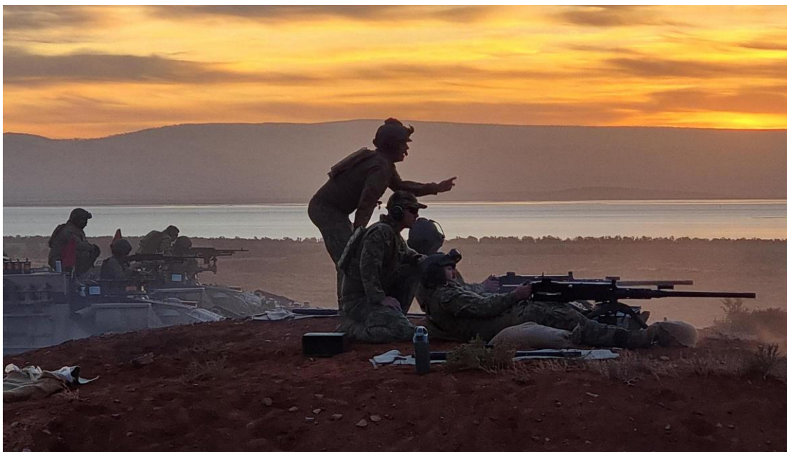
Ground mount firing the 12.7mm M2HB QCB machine gun (.50 Cal) at the Cultana courses camp