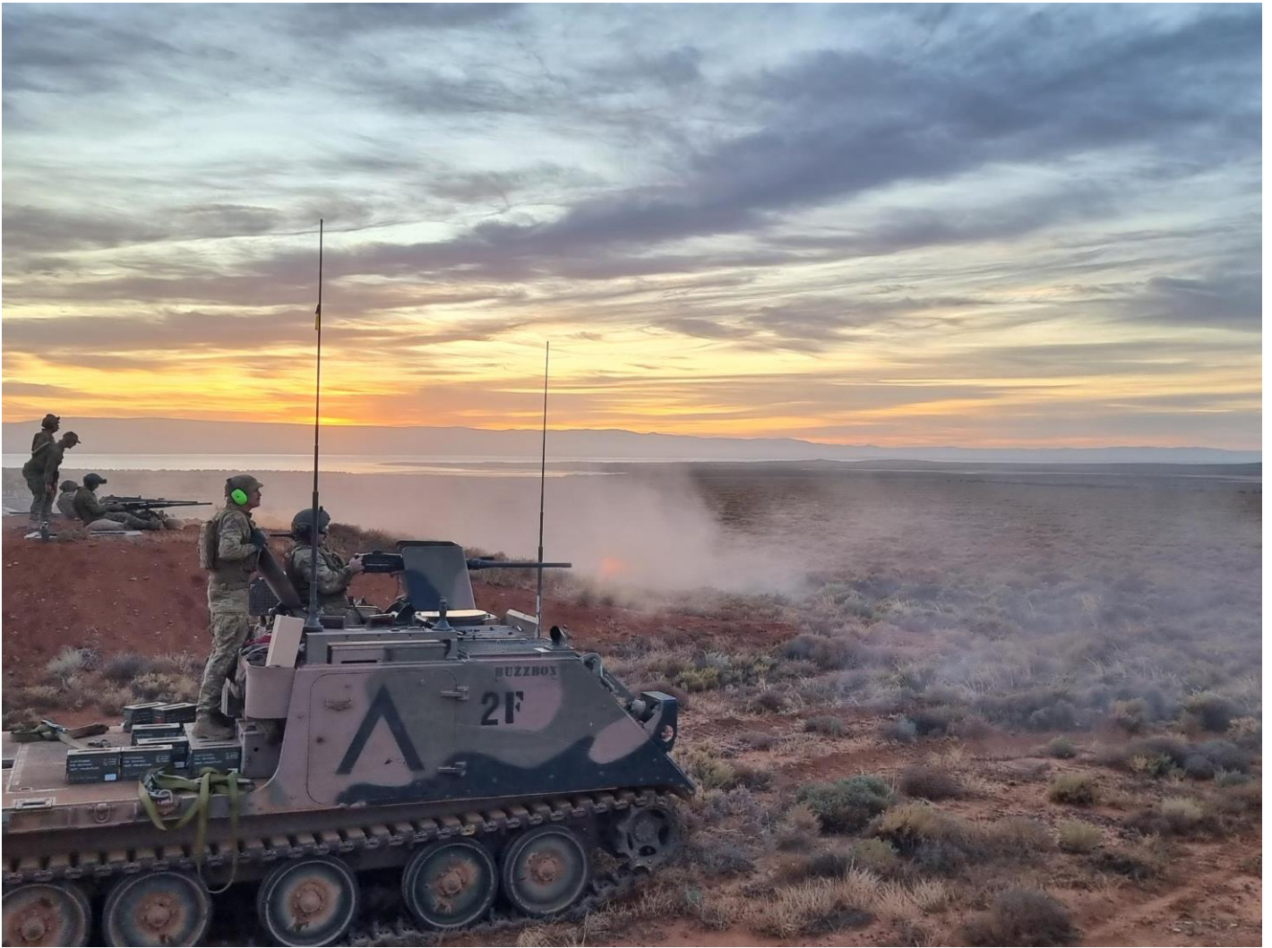
C/S 2F, 'Buzzbox' joins in firing with the ground mounted 50 cal's 2F is a M113AS4 Armoured Logistics Vehicle (ALV)