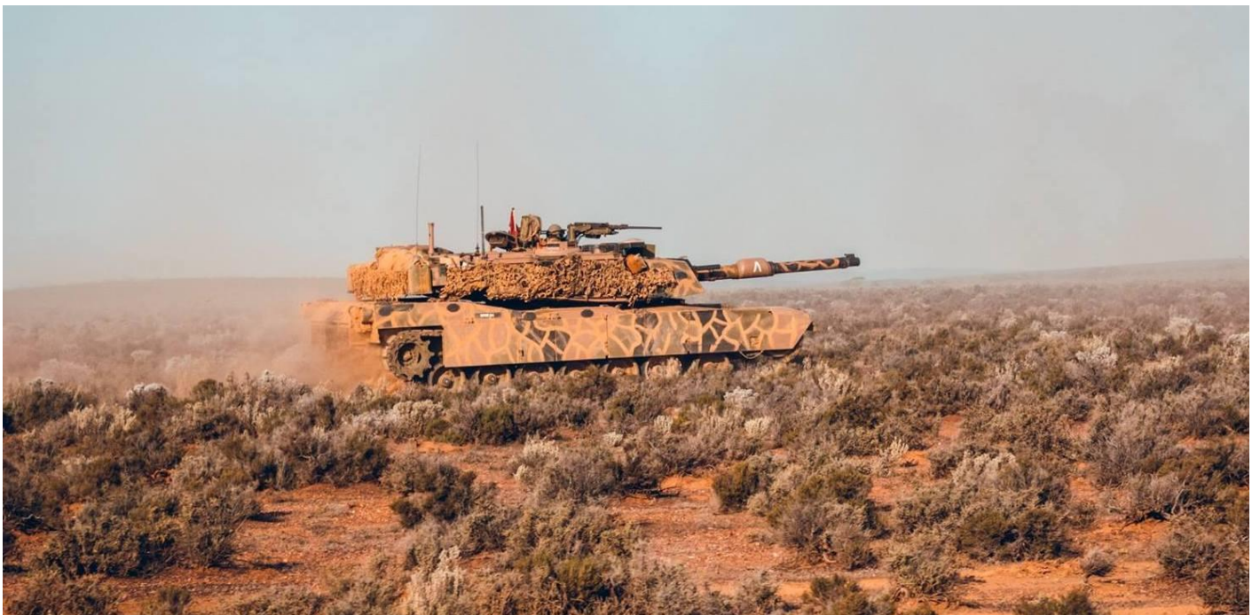
C/S 2C on the hunt!