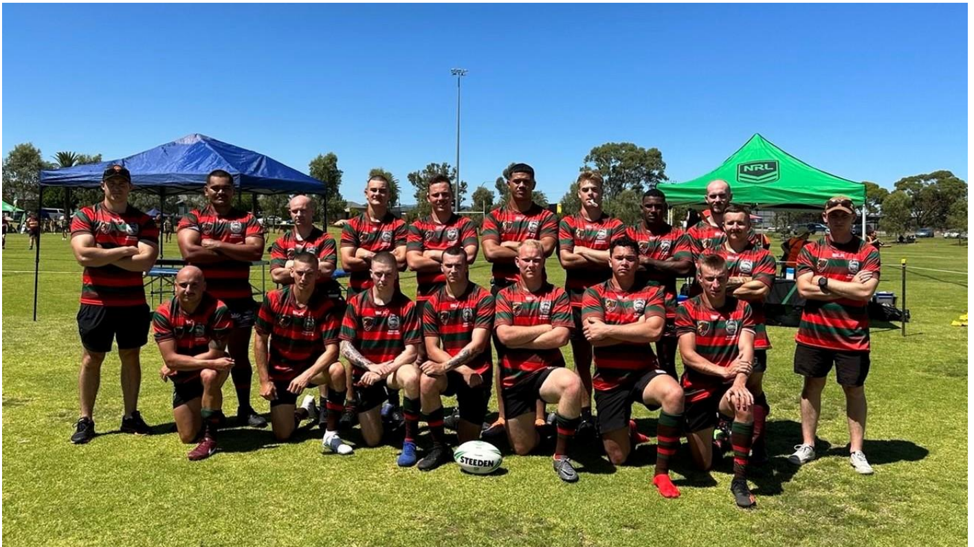
The 1st Armoured Regiment Rugby team (with support from their mates at 7 RAR and 11 SQN, RAAF) participated in the Harmony Cup Rugby League 9's Carnival on Sunday, 19th of February 2023. Scoring 64 points during the pool stages and earning themselves a spot in the Quarter Final, they were unfortunate to go down 24 – 10 against the Pacific Island All Stars. Well done!