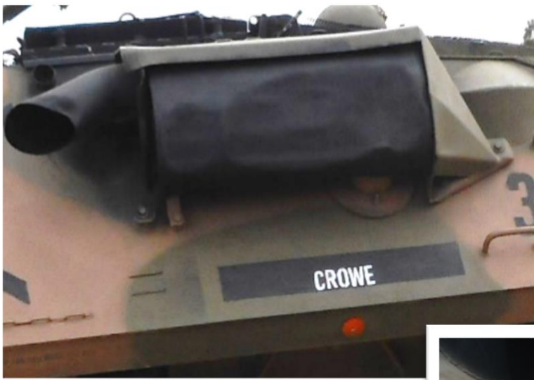
Ambrose Crowe (Decd.) 32A - 2 Troop C Squadron FSB Coral 1968 SVN