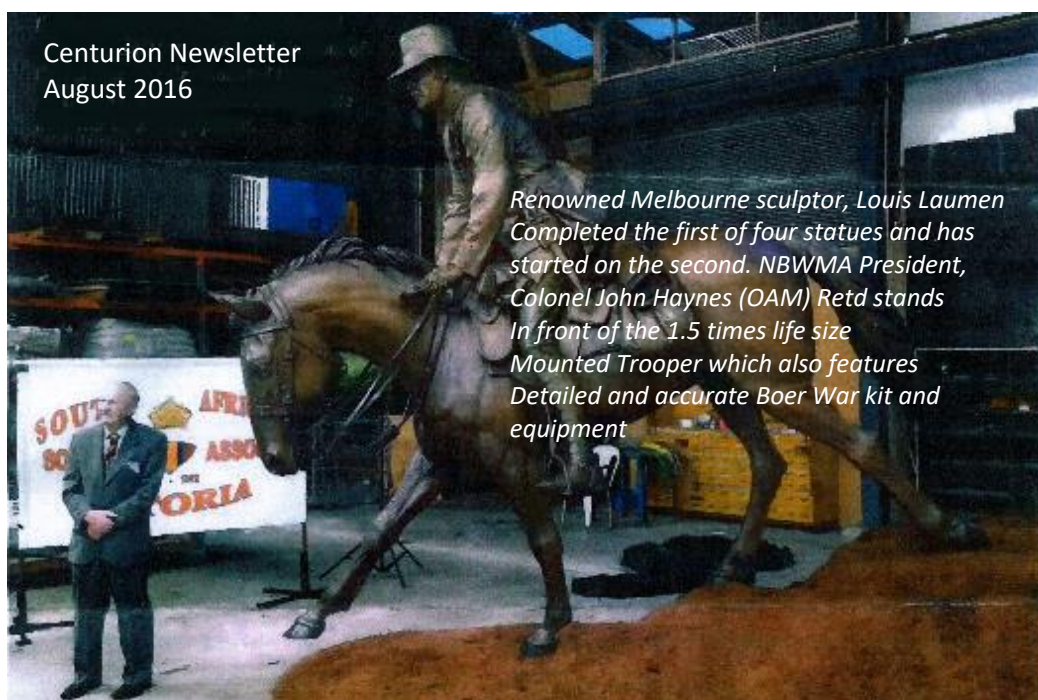
Centurion Newsletter August 2016