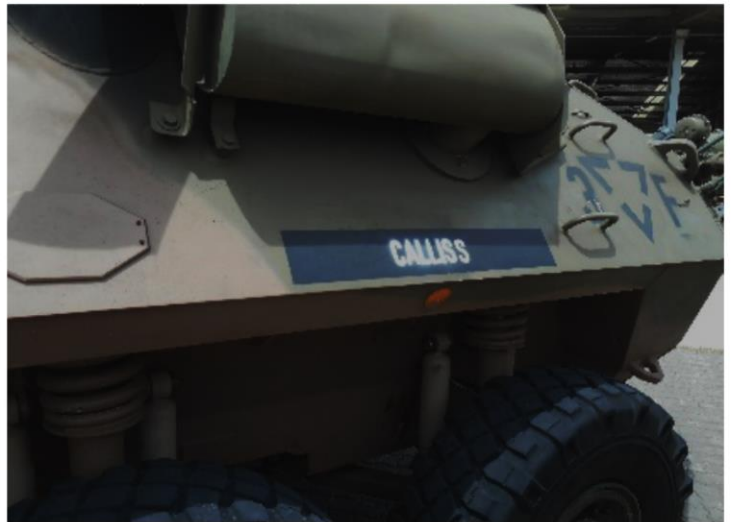
31A Neville Calliss (Decd.) 1 Troop C Squadron FSB Coral 1968 SVN