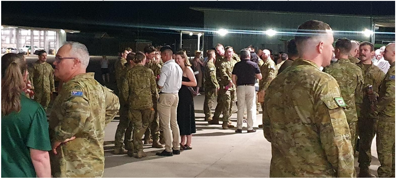
Post parade BBQ in the Mick Rainey MM Club