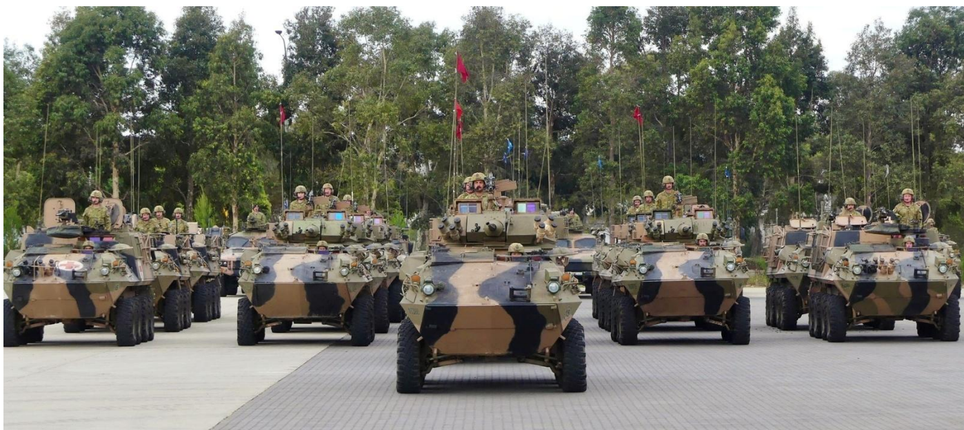
A Squadron formed up on parade