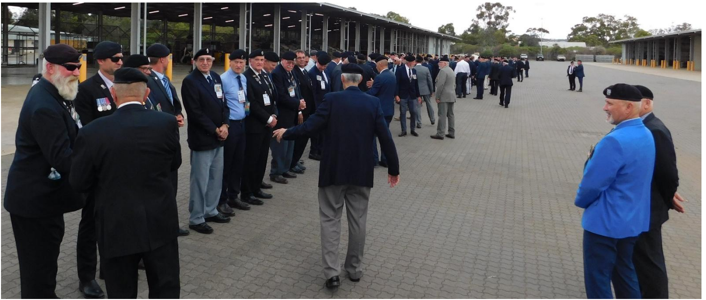
The 'tall' end of sizing the veterans prior to marching onto parade.