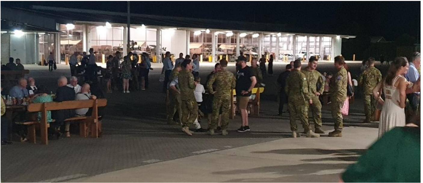
Post parade BBQ in the Mick Rainey MM Club