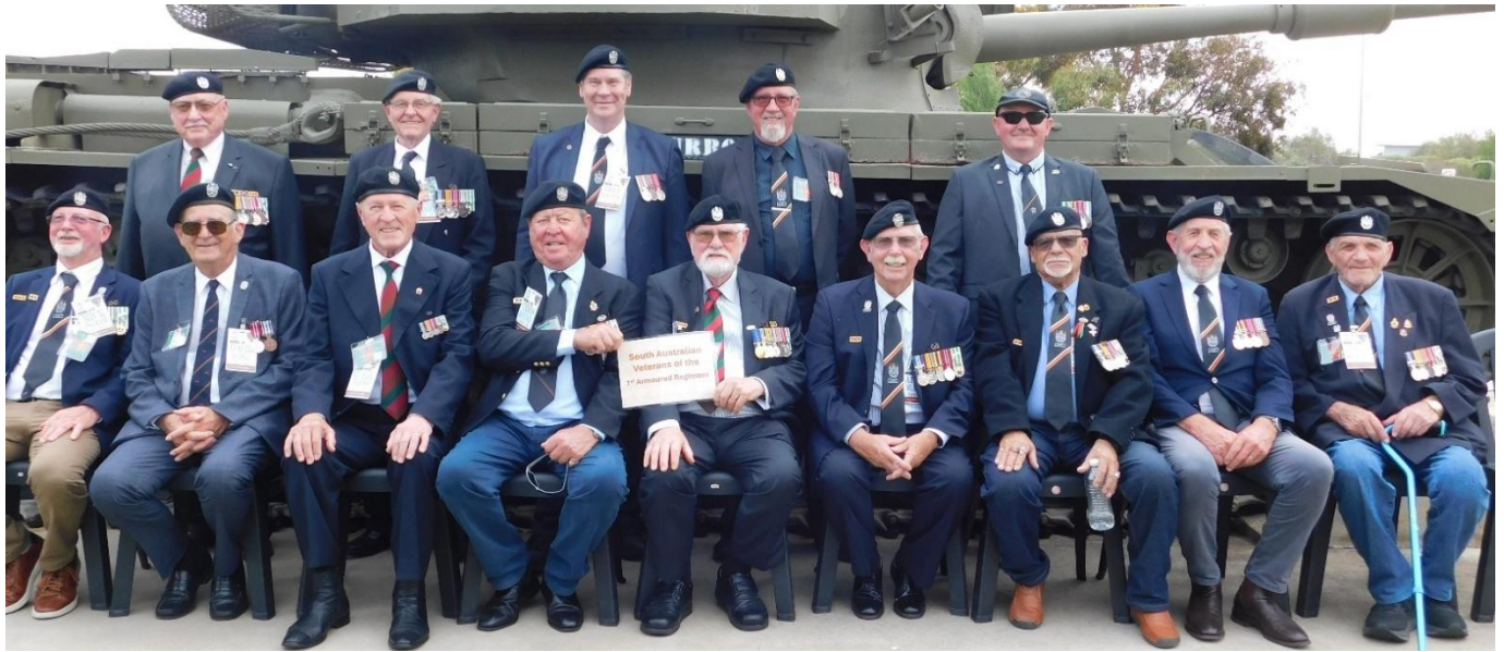
South Australian Veterans