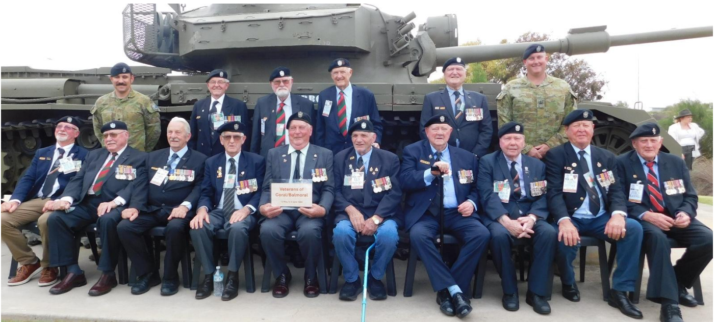
Coral Balmoral Veterans