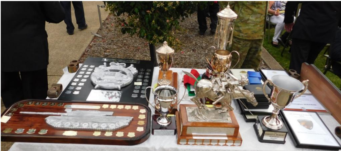
A very full trophy table