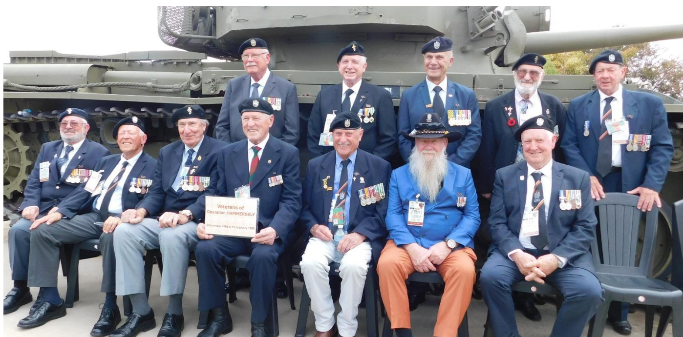
OP Hammersley Veterans