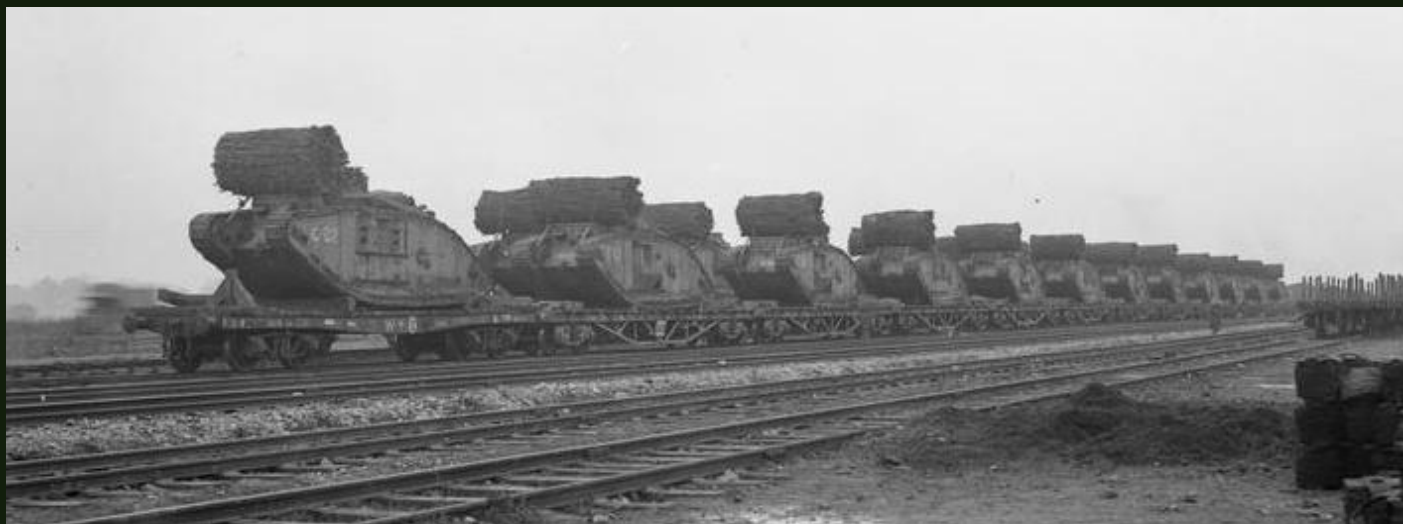
British Mark IV Female and Male Tanks of 'C' Battalion, including 'Crusty' and 'Centaur II' loaded aboard a train at Plateau Station in preparation for movement to the forward area prior to the opening of the Battle of Cambrai.