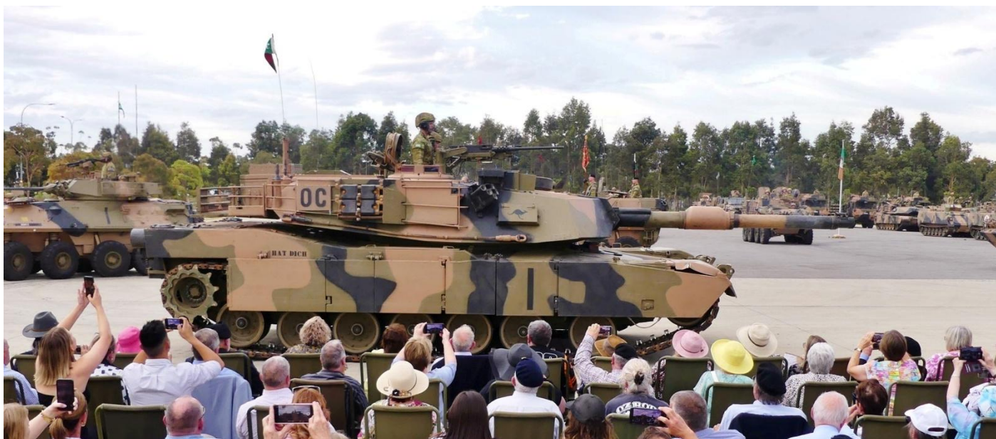
The Commanding Officer mounted on Zero Charlie leads the march past