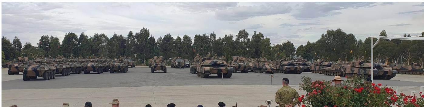
The Regiment on parade