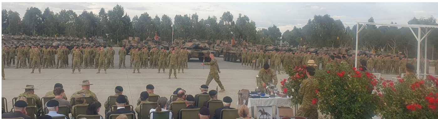
The Regiment dismounted during the award presentations