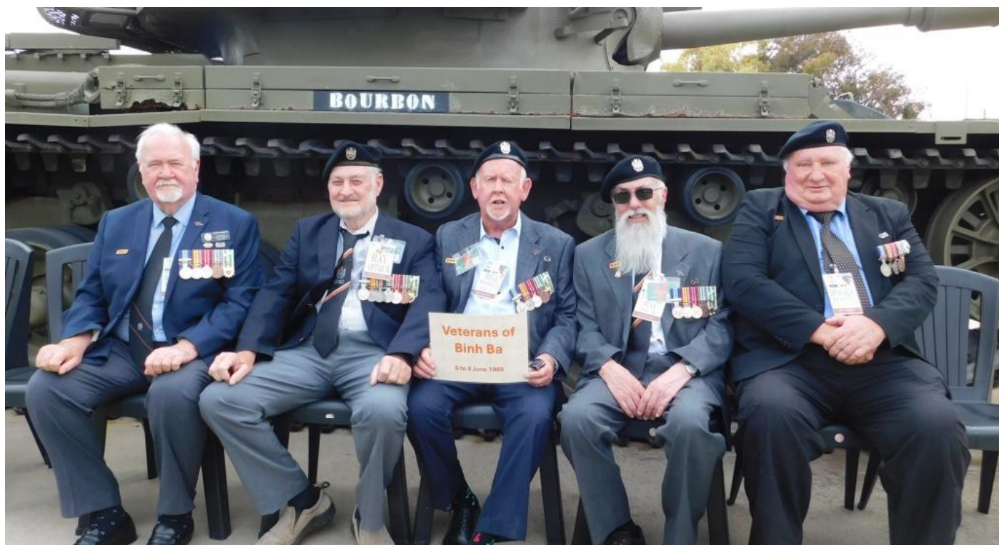
Binh Ba Veterans