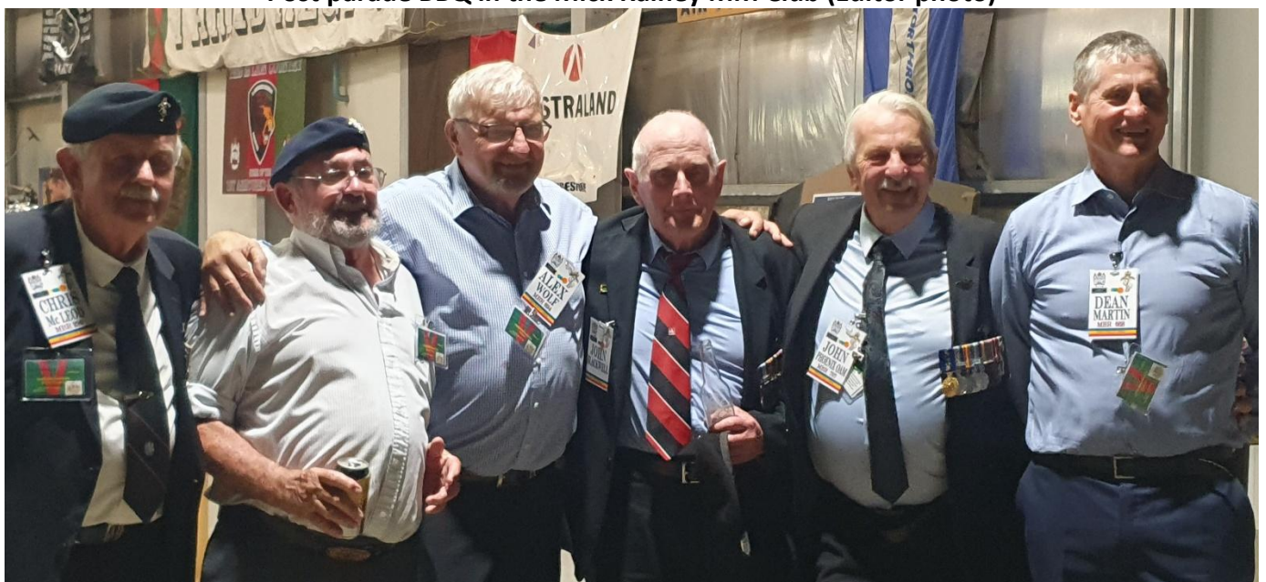
A classic 'Toolbox' of Spanners: